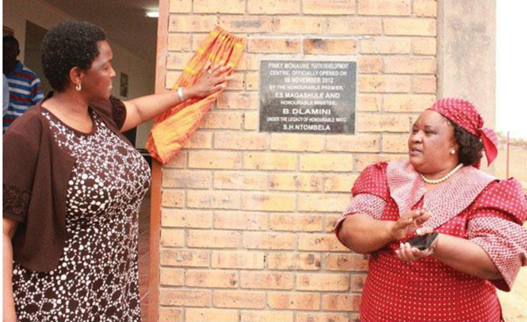
Youth development partnership ... Social development minister, Bathabile Dlamini and Free State department of social development, Sisi Ntombela, open the centre